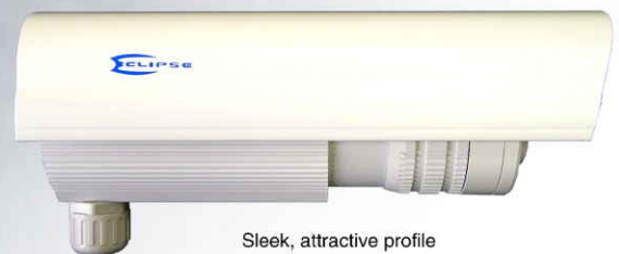
Sleek, attractive profile